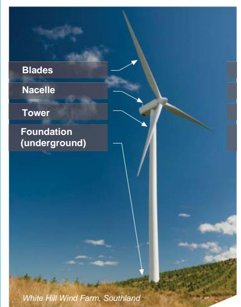
White Hill Wind Farm, Southland

that the optimum amount of power is extracted from the wind.