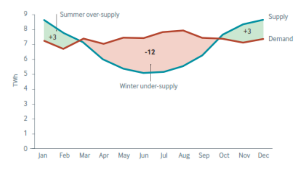
Dry year winter peak challenge