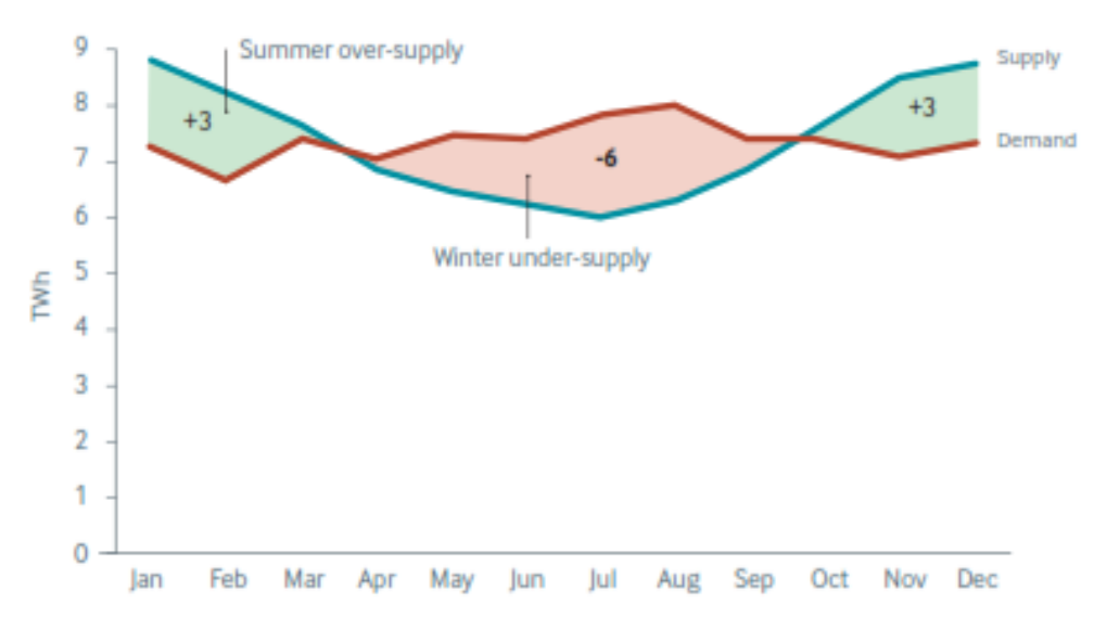
Normal estimates of electricity supply and demand